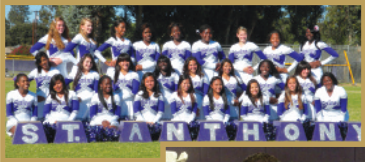
SAHS Cheer Squad