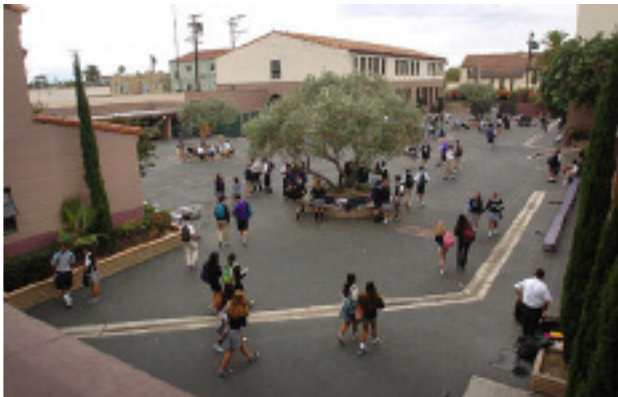
The St. Anthony High School student body fills the courtyard during lunch on Monday. The school is celebrating its 90th anniversary on Saturday.