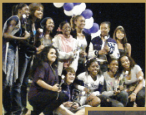
2010 Homecoming— Honoring the CIF Champs