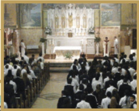
Students attending Mass to celebrate the opening of the school year