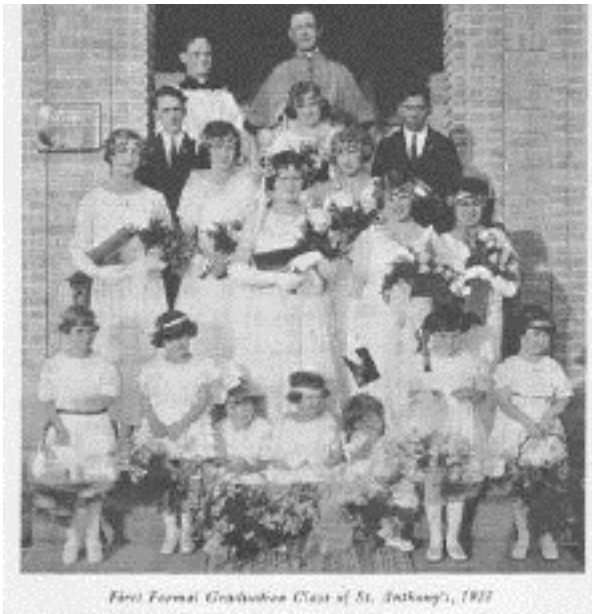
First graduating class at St. Anthony High School in 1923. Nine students total (seven girls and two boys).

By the end of the 1990s, the nuns and the members of the Brothers of Holy Cross had left the school, which like many parochial schools began relying more on lay faculty. Like other Catholic schools, St. Anthony faced serious fiscal challenges in the 1990s and early 2000s due to declining enrollment.