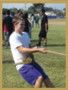
Senior-Freshmen Tug of War