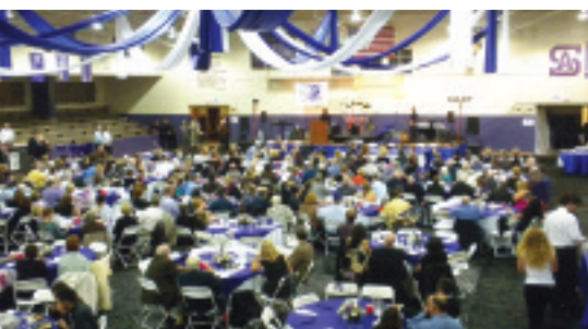
350 participants all agree; truly the place to be!

by Pat O'Shea Kelly '51 Hall of Fame 2010