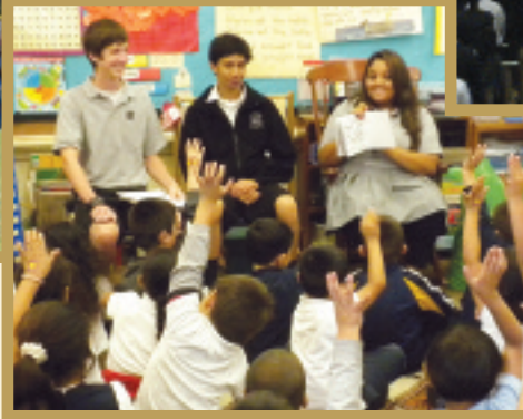
President's Ambassadors deliver backpacks and read to 1st graders at a local elementary school